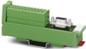
The illustration shows the version UM 25-D 9SUB/B/FRONT/Q

VARIOFACE SLIM LINE, with screw connection and D-subminiature socket strip, for assembly at a right angle on NS 35/7.5, 25 positions