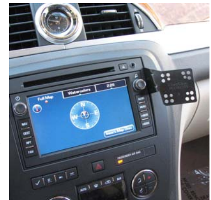
Buick Enclave Final Install Picture