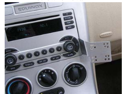
Lower Installation Location