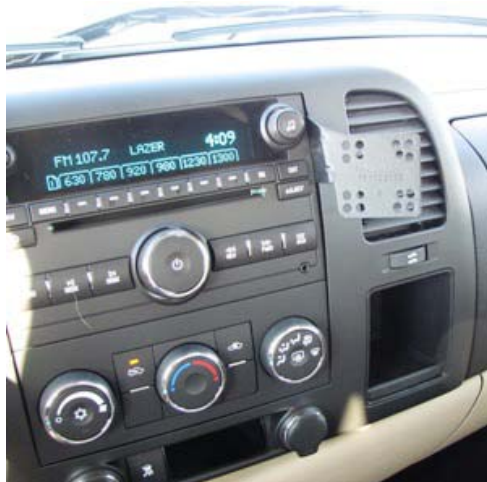
Installation of InDash Mount on Work Truck dash