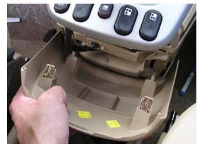
Removal of back cover

INSTALLATION IS NOW COMPLETE. ENJOY YOUR NEW INDASH by PANAVISE MOUNT.