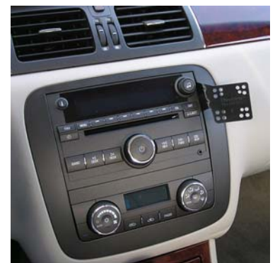
Buick Lucerne 2006 Mount Installed