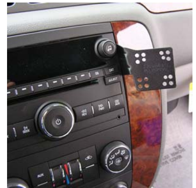
Chevy Tahoe, Suburban 2007

INSTALLATION IS NOW COMPLETE. ENJOY YOUR NEW INDASH by PANAVISE MOUNT.