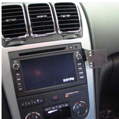
Final Installation Picture