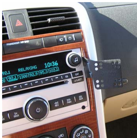
InDash installed showing upper location on new style radio.