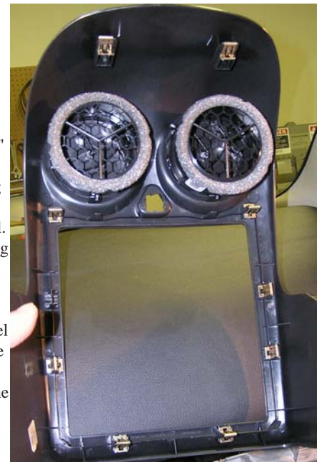
Radio bezel showing clip loca-

INSTALLATION IS NOW COMPLETE. ENJOY YOUR NEW INDASH by PANAVISE MOUNT.