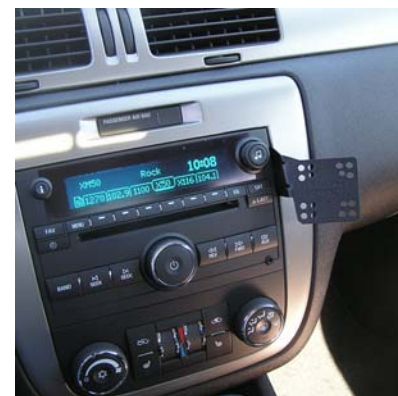
Impala, Monte Carlo Install Picture

Read instructions completely prior to starting installation. All InDash Mounts are designed so that after installation, phone is facing normal driver position for left-hand drive vehicles. This mount is not designed to be used in foreign countries with right-hand drive vehicles. Use extreme care when working around the plastic components on the dash. Excess force, can cause breakage of the plastic components.