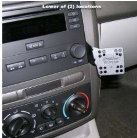
InDash Lower Mounting Location