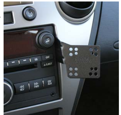
Saturn Ion Final Installation Picture