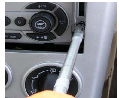
Lower Installation Location screw removal