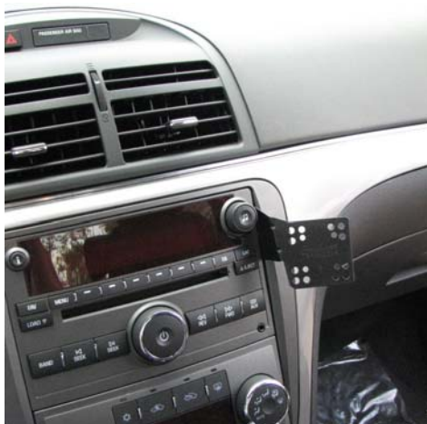
InDash Installed Showing Location

INSTALLATION IS NOW COMPLETE. ENJOY YOUR NEW INDASH by PANAVISE MOUNT.