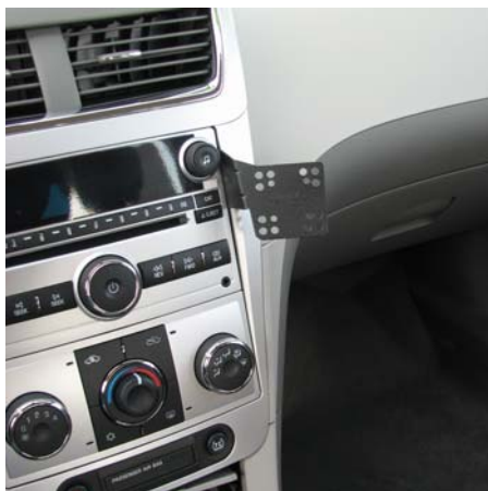
Final Installation Picture